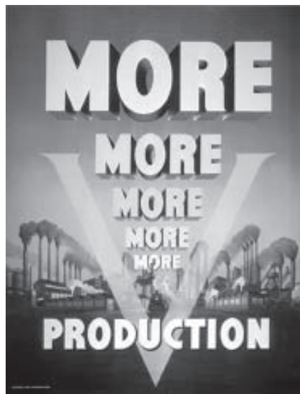
National Museum of American History, Smithsonian Institution

Produce for Victory is part of Museum on Main Street, a collaboration between the Smithsonian Institution and the Federation of State Humanities Councils.